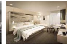
CHRISTCHURCH Sudima Christchurch City