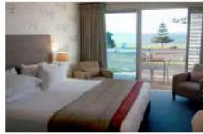
NAPIER The Crown Hotel