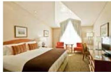
QUEENSTOWN Millennium Queenstown