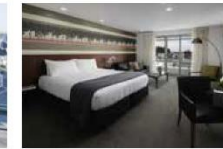
CHRISTCHURCH Rydges Latimer Christchurch