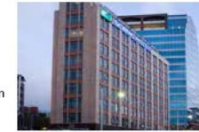
AUCKLAND Scenic Hotel Auckland