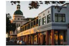
NAPIER Art Deco Masonic Hotel