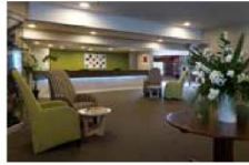
ROTORUA Sudima Hotel Lake Rotorua