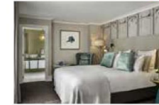
AUCKLAND - Hotel Grand Windsor MGallery by Sofitel