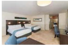
DUNEDIN Scenic Hotel Southern Cross