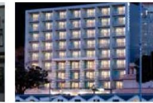
WELLINGTON Copthorne Hotel Oriental Bay