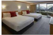
MT COOK The Hermitage Hotel