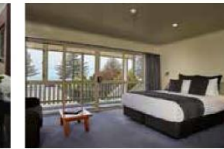
KAIKOURA The White Morph