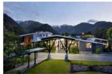
GLACIER REGION Scenic Hotel Franz Josef Glacier