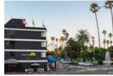
NAPIER Espresso Hotel