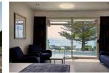
KAIKOURA The White Morph