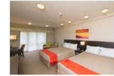
BAY OF ISLANDS Scenic Hotel Bay of Islands