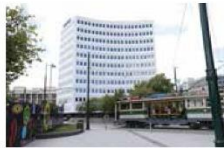
CHRISTCHURCH Distinction Christchurch