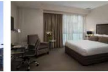
AUCKLAND Rydges Auckland