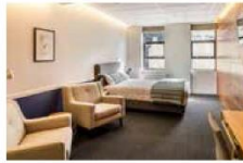
WELLINGTON Park Hotel Lambton Quay