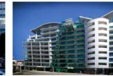
WELLINGTON Distinction Wellington