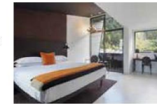
QUEENSTOWN Queenstown Park Boutique Hotel