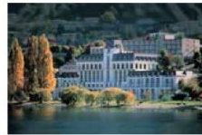
QUEENSTOWN Rydges Lakeland Resort