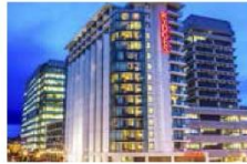
WELLINGTON Rydges Wellington