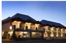
KAIKOURA The White Morph