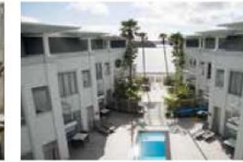
BAY OF ISLANDS The Waterfront Suites