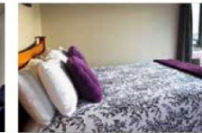
GREYMOOUTH Breakers Boutique Accommodation