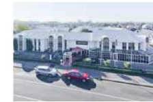
CHRISTCHURCH Pavilions Hotel Christchurch