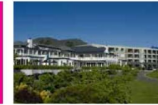
TAUPO Hilton Lake Taupo