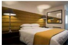
GREYMOOUTH The Ashley Hotel Greymouth