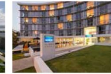
NAPIER Scenic Hotel Te Pania