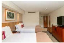
AUCKLAND Copthorne Hotel Auckland City