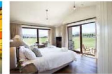
WANAKA Wanaka Haven