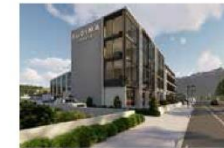
KAIKOURA Sudima Kaikoura