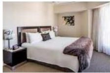
WELLINGTON The Bolton Hotel