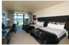
TAUPO Millennium Taupo