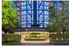
AUCKLAND Grand Millennium