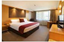
ROTORUA - Millennium Hotel & Resort Taupo Manuels