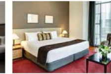
AUCKLAND Heritage Auckland