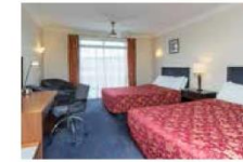
ROTORUA Distinction Rotorua