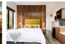
GLACIER REGION Rainforest Retreat