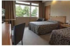
ROTORUA Copthorne Hotel Rotorua