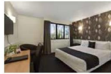
CHRISTCHURCH Quality Hotels Elms