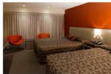
DUNEDIN Kingsgate Hotel Dunedin