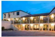
KAIKOURA Lobster Inn Motor Lodge