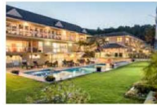
BAY OF ISLANDS Kingsgate Hotel Autolodge