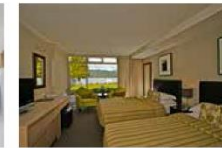
TE ANAU Distinction Te Anau Hotel & Villas