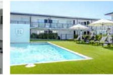
ROTORUA Regent of Rotorua Boutique Hotel