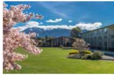
TE ANAU Distinction Te Anau Hotel & Villas