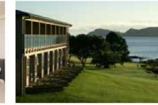
BAY OF ISLANDS Copthorne Hotel & Resort Bay of Islands