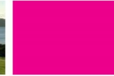
ROTORUA Holiday Inn Rotorua