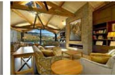
QUEENSTOWN - The Rees Hotel, Luxury Apartments & Lakeside Residences