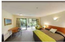
GLACIER REGION Studio Room