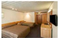
TE ANAU Kingsgate Hotel Te Anau