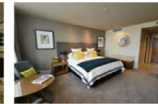
DUNEDIN Distinction Dunedin