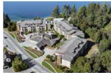
QUEENSTOWN Heritage Queenstown