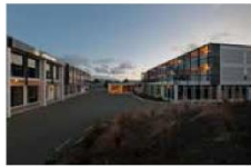
CHRISTCHURCH The Ashley Hotel