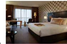
WELLINGTON QT Wellington