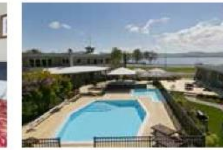
TAUPO Anchorage Resort