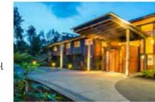
GLACIER REGION Te Waoanui Forest Retreat