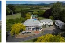
NAPIER Mangapapa Hotel