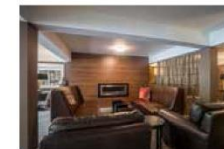
GREYMOUTH The Ashley Hotel