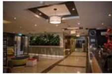
AUCKLAND Auckland City Hotel