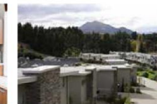
WANAKA Distinction Wanaka