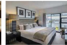
CHRISTCHURCH The George Hotel