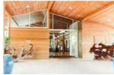
BAY OF ISLANDS Copthorne Hotel & Resort Bay of Islands