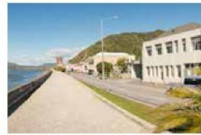
GREYMOUTH Kingsgate Hotel Greymouth