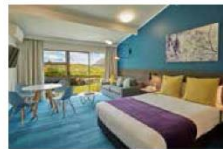
MT COOK Mt Cook Lodge & Motels